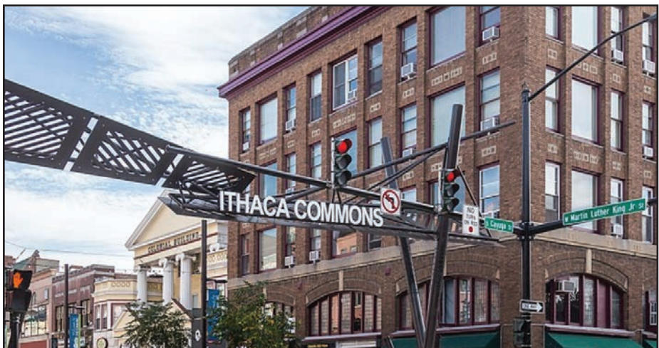
The Ithaca Commons is among the focus areas in a new study detailing a retail strategy for the Tompkins County community.

Specifically, MJB identified an opportunity to market Ithaca, and downtown Ithaca in particular, to the “yupster” psychographic — well-educated, well-off households that celebrate the artistic and creative lifestyle — which predominates among both Ithacans as well as tourists. Preliminary recommendations The MJB study recommends curating a retail mix in downtown Ithaca that focuses on the merchandising of arts and crafts products as well as handmade goods more generally, complemented by other synergistic tenants like bookstores, vintage/consignment shops, cafes, eateries and wine bars. It also recommends providing support for landlords and brokers to recruit tenants that align with this positioning, including the creation of leasing materials that tell Ithaca’s and downtown Ithaca’s “unique” story. In addition, the report recommends developing targeted marketing campaigns to position Ithaca as a must-visit regional “(if not national)” destination for the arts and artisan culture, aligning with the “Ithaca is Gorges” brand. MJB also recommends enhancing downtown’s role as a regional hub for the creative ecosystem by fostering collaborations between local makers, galleries,